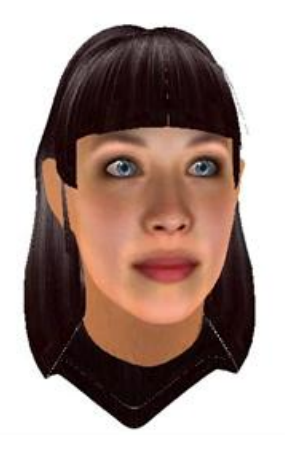
Figure 1. LUCIA talking head [10].

We envision a new generation of intelligent and embodied animated agents that engage users in natural face-to-face conversational interaction in learning and language training tasks. An intelligent agent is one that mimics the actions of real persons and behaves intelligently in the context of a specific application or task domain. An embodied agent is one that resembles a real person. The goal of our work is to invent intelligent animated agents, such as LUCIA [9] illustrated in Figure 1, that engage children in face-to-face conversational interaction to help them learn to speak, understand, read and write language. In our software applications we are creating, the animated agents will interact with Italian and English speaking children with speech and/or reading difficulties.