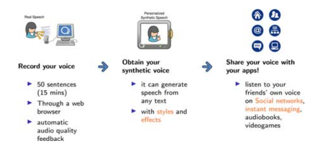
Figure 1: MIVOQ PTTS voice creation procedure.

The current prototype for MIVOQ PTTS (schematically drawn in Figure 1) consists of a web application where users can record sentences and automatically obtain a personalized TTS voice model that will possess the vocal characteristics of the author of the recordings.