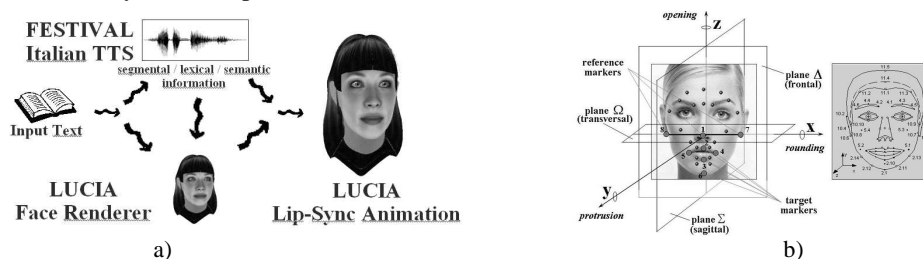
Figure 1. a) LUCIA's functional block diagram, b) position of reflecting markers and reference planes for the articulatory movement data collection ( on the left ), and the MPEG-4 standard facial reference points ( on the right )

Various applications can be conceived by the use of animated characters, spanning from research on human communication and perception, via tools for the hearing impaired, to spoken and multimodal agent-based user interfaces. The recent introduction of WebGL, which is 3D graphics in web browsers, opens the possibility to bring all these applications via internet. A software porting of LUCIA facial animation framework is currently in development.